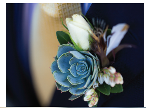
Getting married on the Coastside makes for a special experience for everyone, with uniquely flawless floral designers, fabulous catering, and unmatched views.